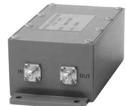
Style A Module

2) Gain into an open circuit. The gain falls slightly to 0.9 (or -1 dB) when operating into a 50Ω load, due to the 5Ω output resistance.