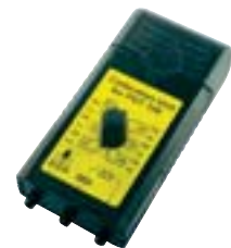
Calibration Unit for PGT®120

When the PGT®120 is operated in the "hands-free mode", the measurement is performed in series through the shoes without touching the contact electrode on the PGT120 unit