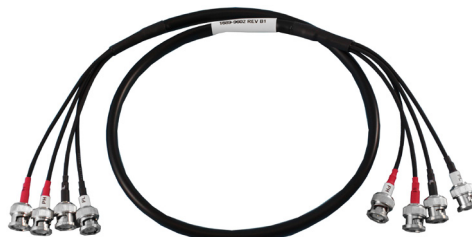
bnc-bnc Extender Cable, 1 m bnc-bnc Extender Cable, 2 m