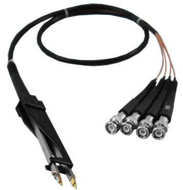
Chip Component Tweezers