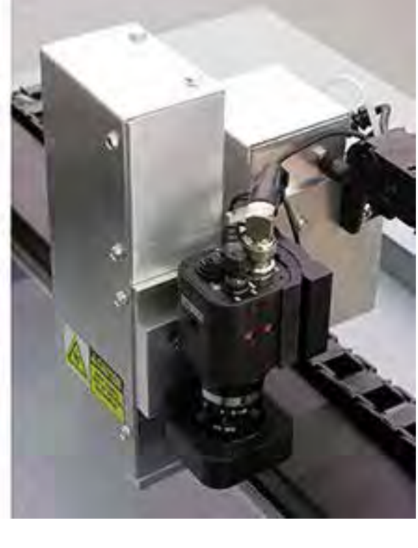
Custom Prober Head used for Mechanical Component Placement (click to enlarge)