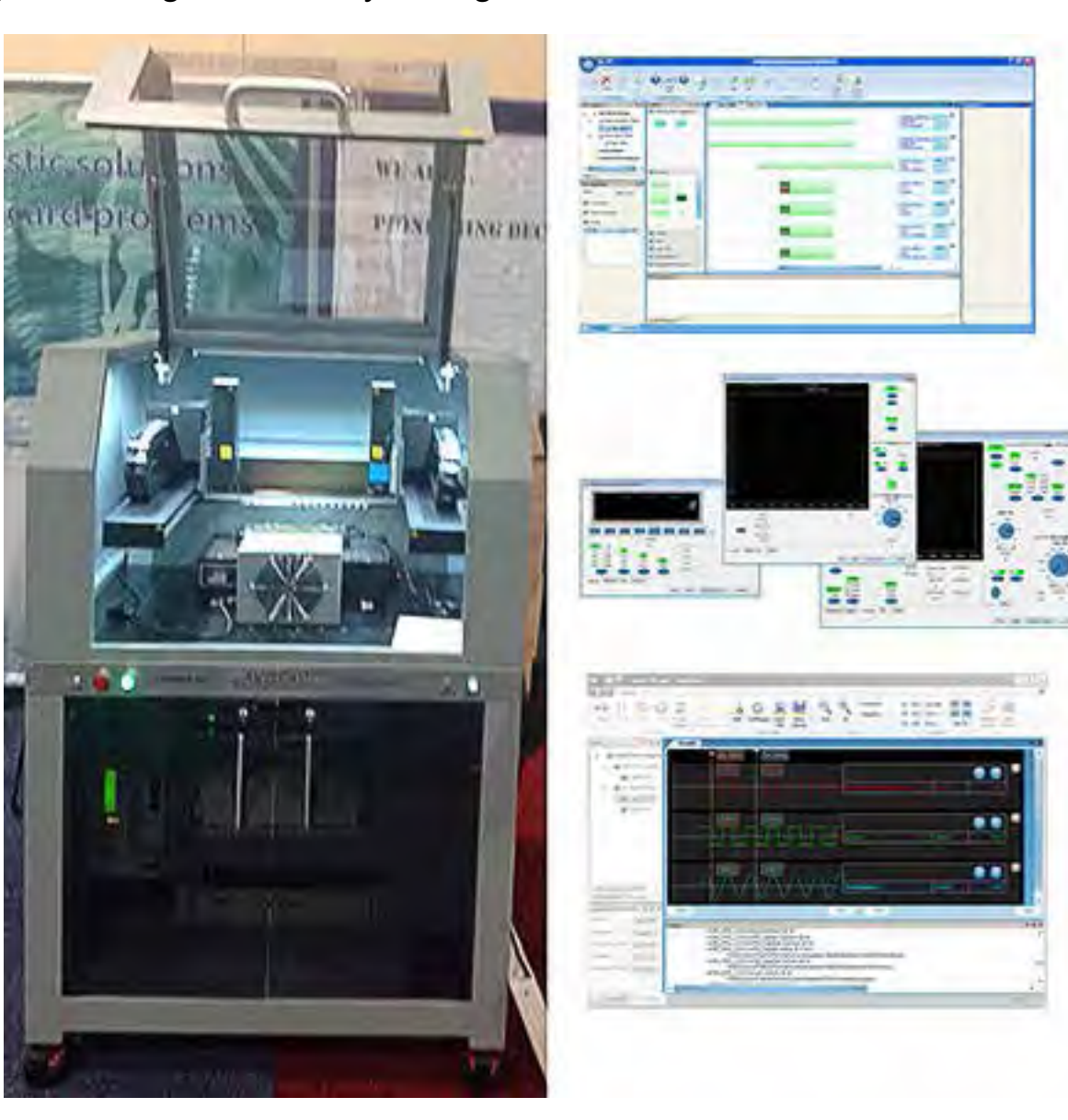
Hardware Integration example - ACCAT system by PIDESO (click to enlarge)

Pioneering Decisive Solutions (PIDESO) has adapted the Huntron Access DH as part of their Advanced Circuit Card Automated Tester system that helps service personnel troubleshoot, repair and perform final test on complex printed circuit cards. The automated portion of the test is driven by custom software that performs tests on points listed in an ambiguity list generated by the ATE portion of the test system. The idea is to provide a complete test system and gain efficiency through automation.