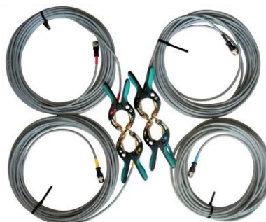
X winding test cable set