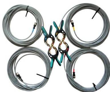
H winding test cable set