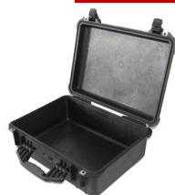
Cable plastic case