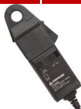
Current clamp 30 / 300 A