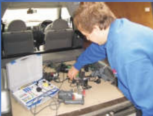
AUTOMATICALLY TESTS... Fuse Test • Earth Bond Insulation Resistance • Leakage Current IN 20 SECONDS

The go-anywhere range of PATs from Transmille can literally save you hours. Firstly, there is no need to waste time locating a mains supply - simply plug in the appliance, clip on the earth bond lead and select CLASS 1 or CLASS 2 test. Secondly, within 20 seconds the entire test sequence is complete - unlike other PATs there is no lengthy setup before you can even begin. Earth bond current is detected from the socket used, and test limits are scaled automatically from the earth bond current and lead length settings. Clear red/green LED indicators make reading the test result easy in any situation. Testing really is that quick & easy.