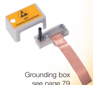
Grounding box see page 79