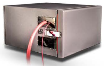
guidance telemetry systems