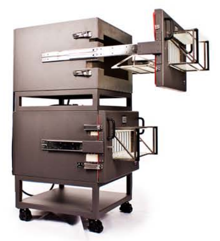
PCB batch production