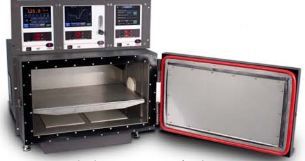
avionics systems production