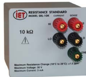
SRL-10 kΩ High-Accuracy Resistance Standard