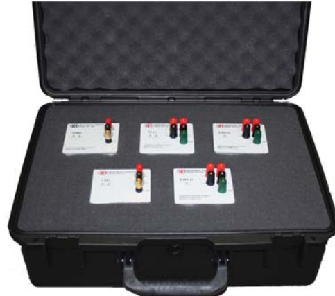
SRC-10-n Transit Case for n units (5 units shown)