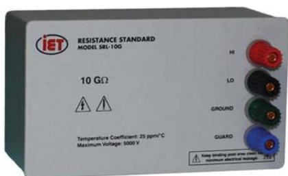
SRL-10 GΩ High-Accuracy Resistance Standard