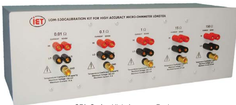
SRL-Series High-Accuracy Resistance Standard Combination Unit