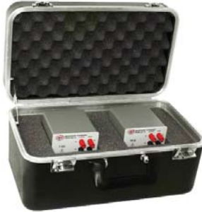
SRC-100 Transit Case for 2 units

changes during transportation or shipping. It is suitable for transporting and storing two or more units.