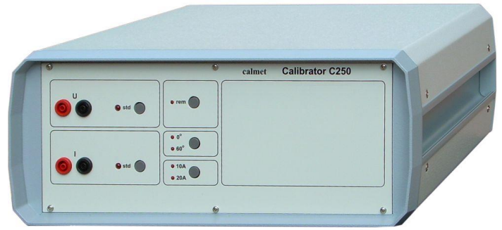
C250 single phase source up to 20A and 240V

Series C250 Calibrators has been built in small size and light weight aluminium case.