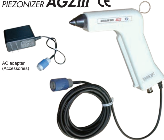
AC adaptor (Accessories)